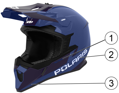
Blue 2865412 / 2865420 (Youth)