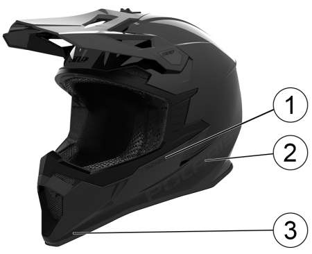
Black 2865408 / 2865418 (Youth)