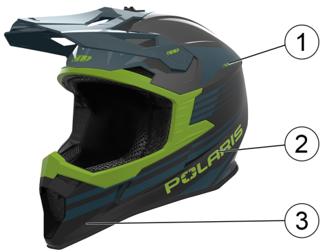
Teal/Lime 2865411 / 2865419 (Youth)